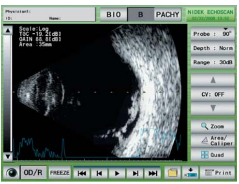
Cross Vector Mode