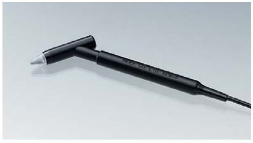
45° fixed Probe*2

The US-4000 / 500 pachymetry mode offers precise measurement of the corneal thickness within a \pm 5 \, \mu m error.