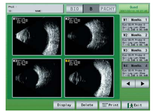
Multi Image Display Function

The results are high quality images, which are essential for accurate analysis. The key to achieving high quality images is through scanning 400 lines over 60° which is displayed on a 1024 x 768 XGA monitor. High contrast of resonated signals and the high quality LCD monitor provide the ideal images for the most accurate diagnosis.