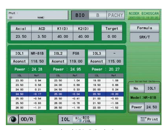
Customized IOL Calculation