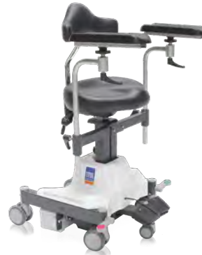
surgiTrend Comfort seat Item No.: 2200 0012