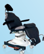
500 XLE comfort