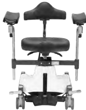
surgiLine Comfort seat Item No.: 2200 0013