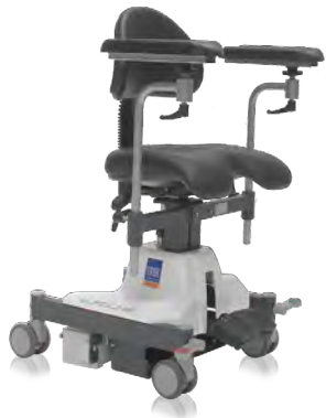
surgiLine Formed seat Item No.: 2200 0008