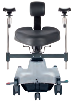
surgiTrend Dynamic seat Item No.: 2200 0010